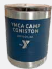
3 WINNERS // YETI

SPREADING OUT YOUR GIFT CAN ADD UP—AND IT IS EASY! CONISTON.ORG/GIVE