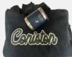
2 WINNERS // SWAG BAG