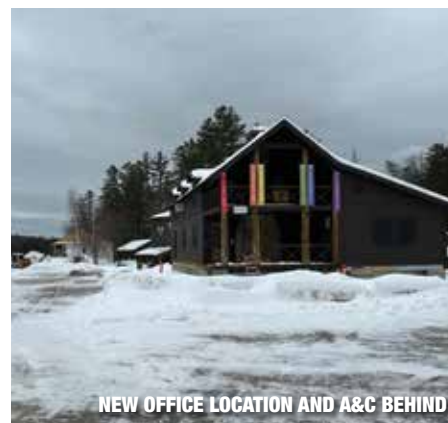
NEW OFFICE LOCATION AND A&C BEHIND