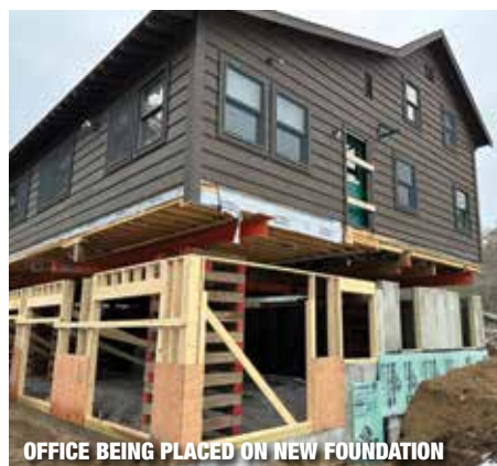
OFFICE BEING PLACED ON NEW FOUNDATION