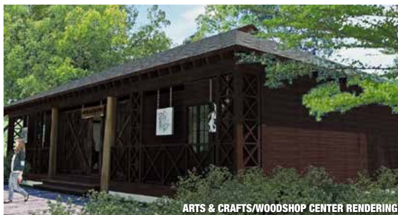
ARTS & CRAFTS/WOODSHOP CENTER RENDERING