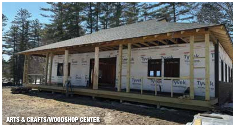
ARTS & CRAFTS/WOODSHOP CENTER