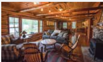
1 WINNER // A WEEKEND AT BIGELOW

Set up a WEEKLY or MONTHLY RECURRING GIFT before the last day of Camp — AUGUST 26TH — and be entered into an exclusive RAFFLE TO WIN: