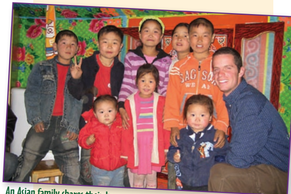
An Asian family shares their home