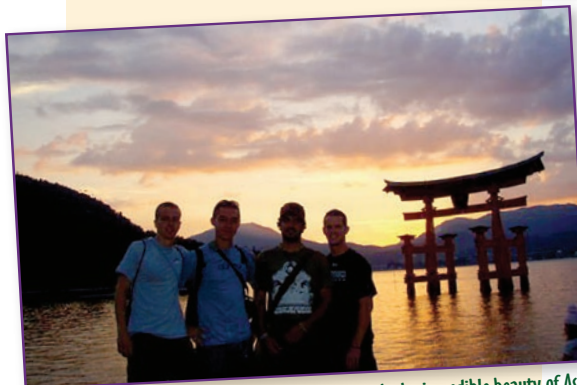
Together with the incredible beauty of Asia

imagine, and some nights we never knew where we'd be sleeping."