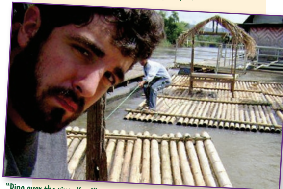
"Pino over the river Kwai"