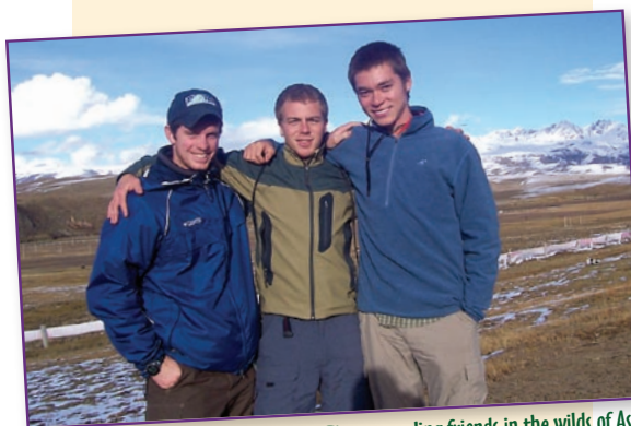
Three traveling friends in the wilds of Asia